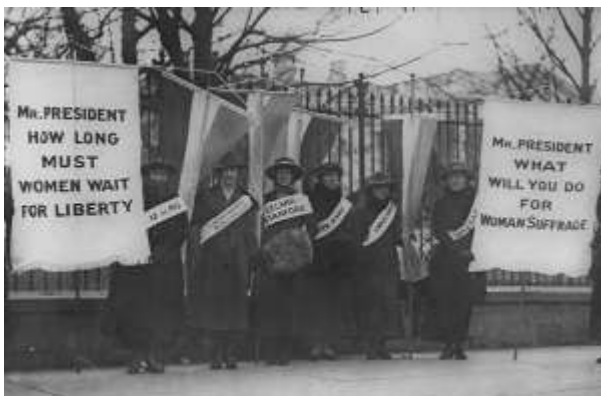
Women suffragists picketing in front of the White House (1917)

This true story has startling parallels to today, as the young activists struggle with issues such as the challenges of protesting a popular President during wartime & the perennial balancing act between love & career. Utilizing a pulsing soundtrack, vivid colors, & a freewheeling camera, Katja von Garnier's ("bandits") driving filmmaking style shakes up the preconceptions of the period film & gives history a vibrant contemporary energy & relevance."